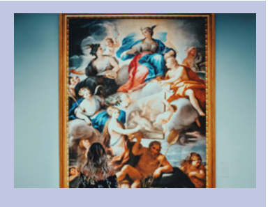
Fine art (per item): $100,000